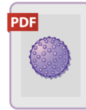
One Page Summary PDF Version