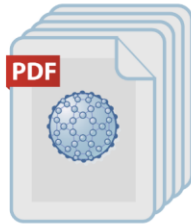
Full Guidance PDF Version

This updated 2025 guidance offers practical recommendations for the prevention, diagnosis, and management of hepatitis B—aimed specifically for primary care providers and non-specialists. Developed by the HBV Primary Care Workgroup, it builds on the original 2020 guidance with simplified, up-to-date information to support clinical decision-making.